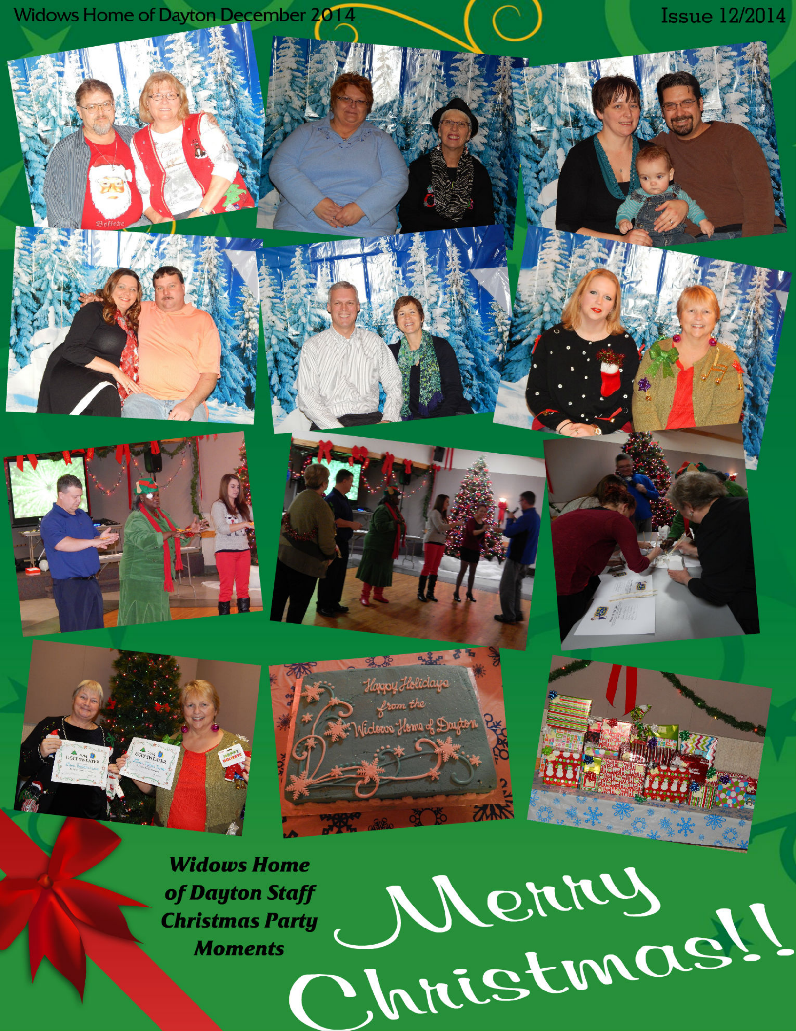
Widows Home of Dayton Staff Christmas Party Moments